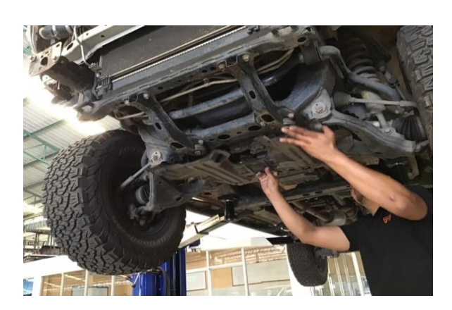
Underbody Protection Plate Toyota Hilux Revo 2018 SD-RD-FT/AC-08 Rev.04 (24-JAN-2024)

Remove any existing Protection Plate original installed on vehicle and discard.