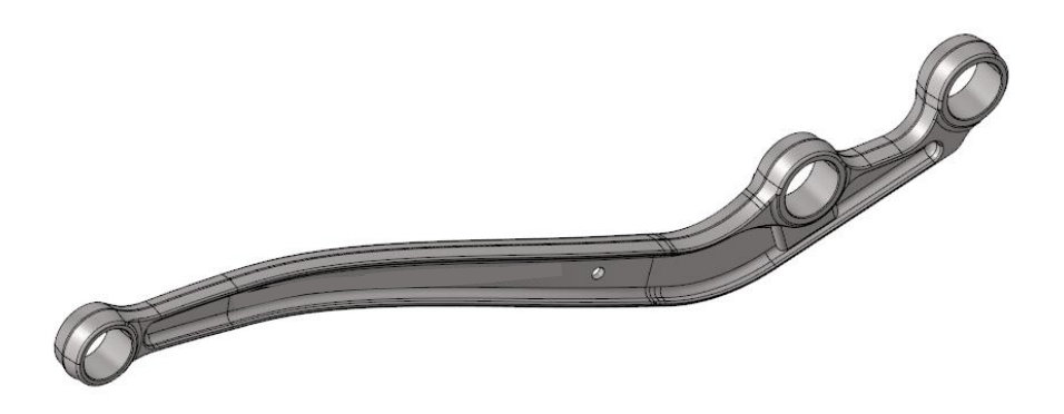
Figure 1: Radius Arm Design