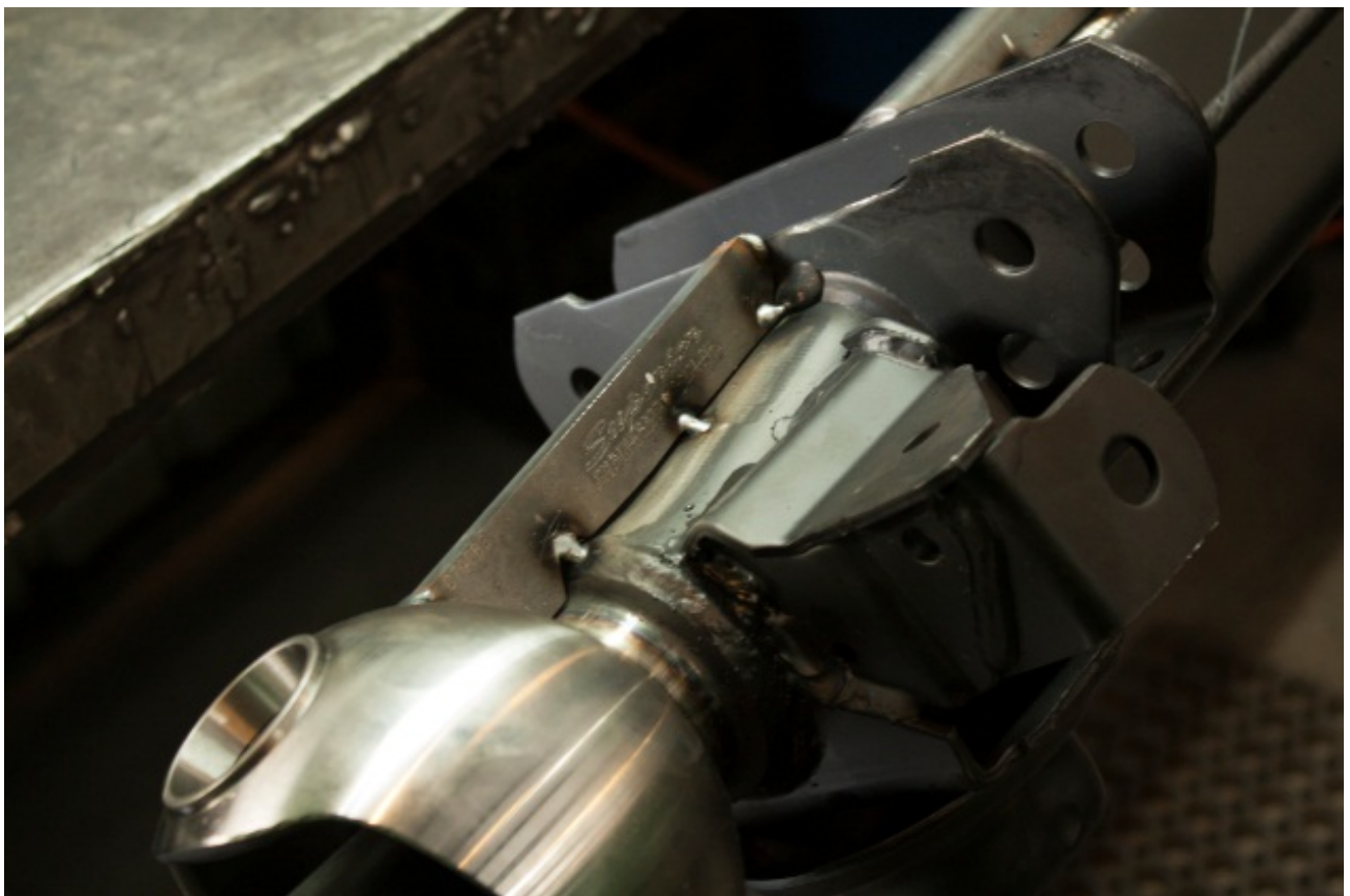
Figure 2: Knuckle Gusset Correct Location