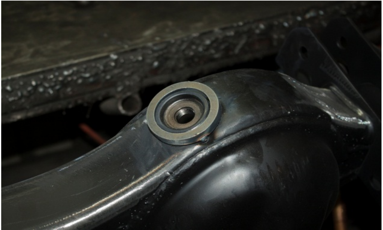
Figure 3: Diff Ring Protector Correct Location