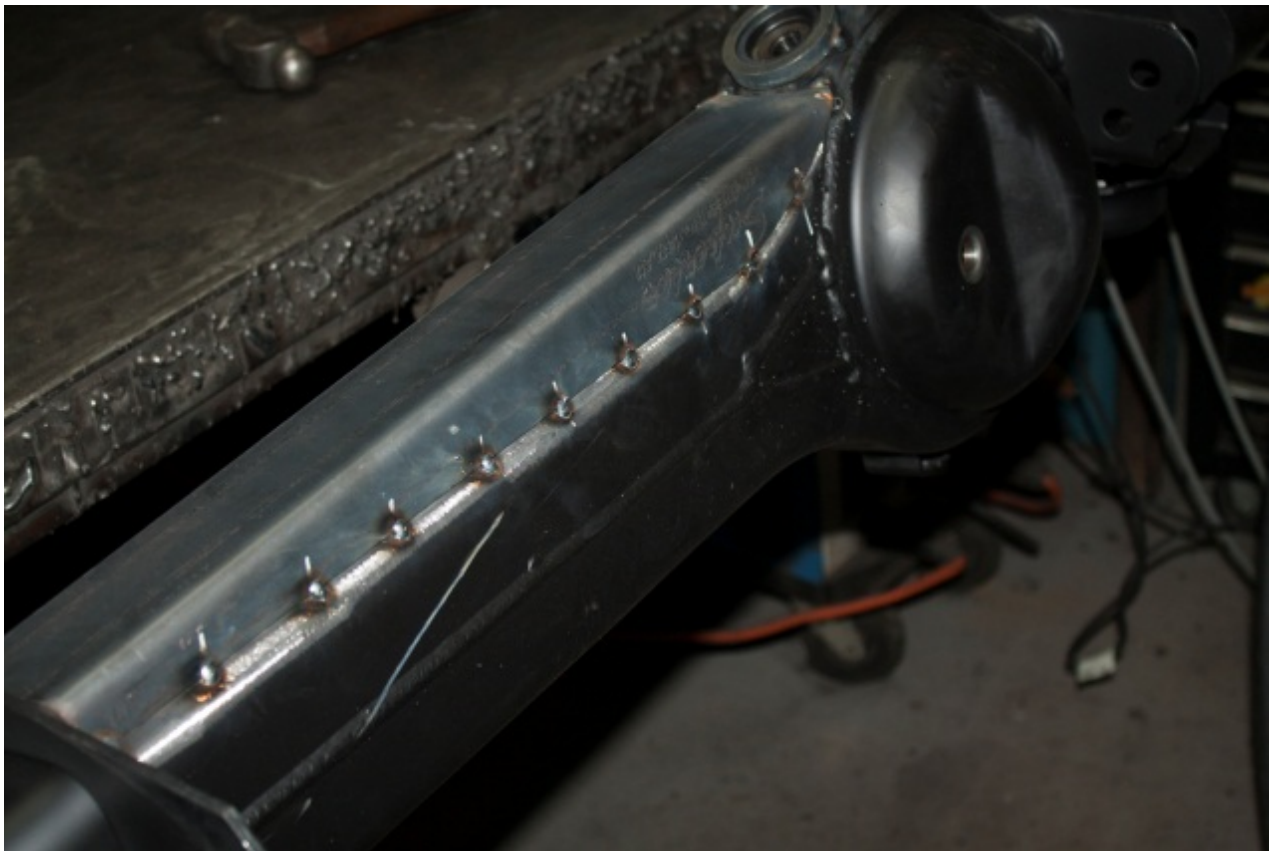
Figure 4: Main Diff Brace Plate Tack Welded In Place