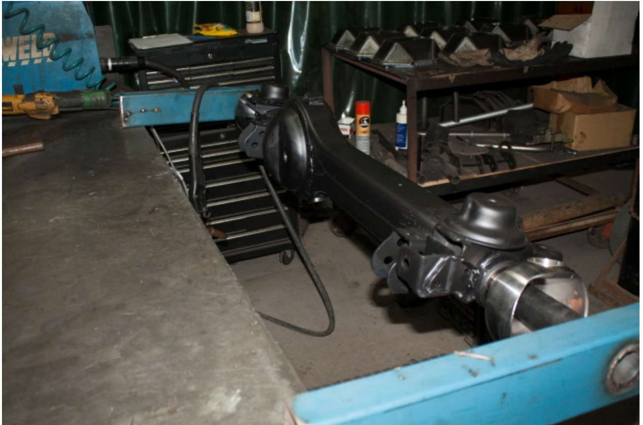
Figure 1: Bare Diff Fully Cleaned