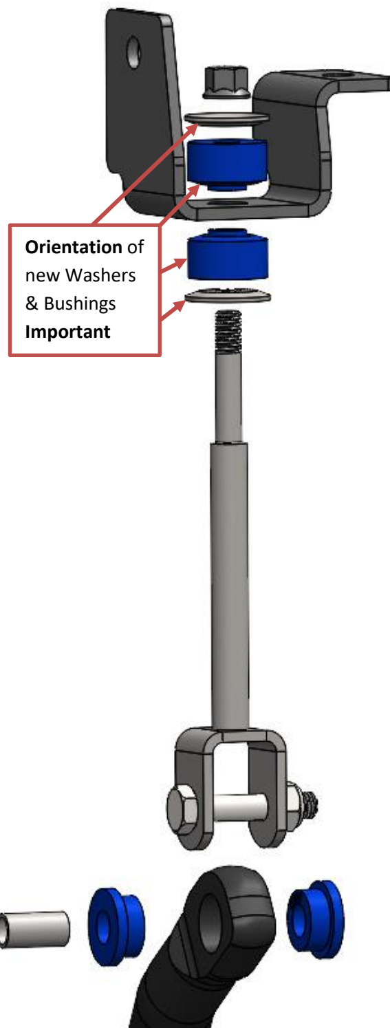
Figure 2 – New SuperPro Bushing Arrangement.

Note: Polyurethane bushings must be fitted to both sides of the vehicle All torque specifications are to be checked after 1000km of travel.