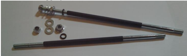
Gigglepin Extended Motor Bolts