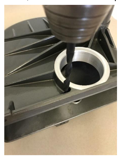
Step 1: Fitting the Angular shim Using a 6.5mm drill bit, place the drill tight into the corner of the casting and, without drilling through the case, create an indent, the centre of which will be your guide for the smaller drill bits. Repeat this on the other side of the main aperture.

To begin, remove the top housing from your winch and set aside. Disassemble your lower housing into its component parts and clean all components thoroughly. Providing the mainshaft needle roller bearing is in good condition, this should be left in place, cleaned & lubricated.